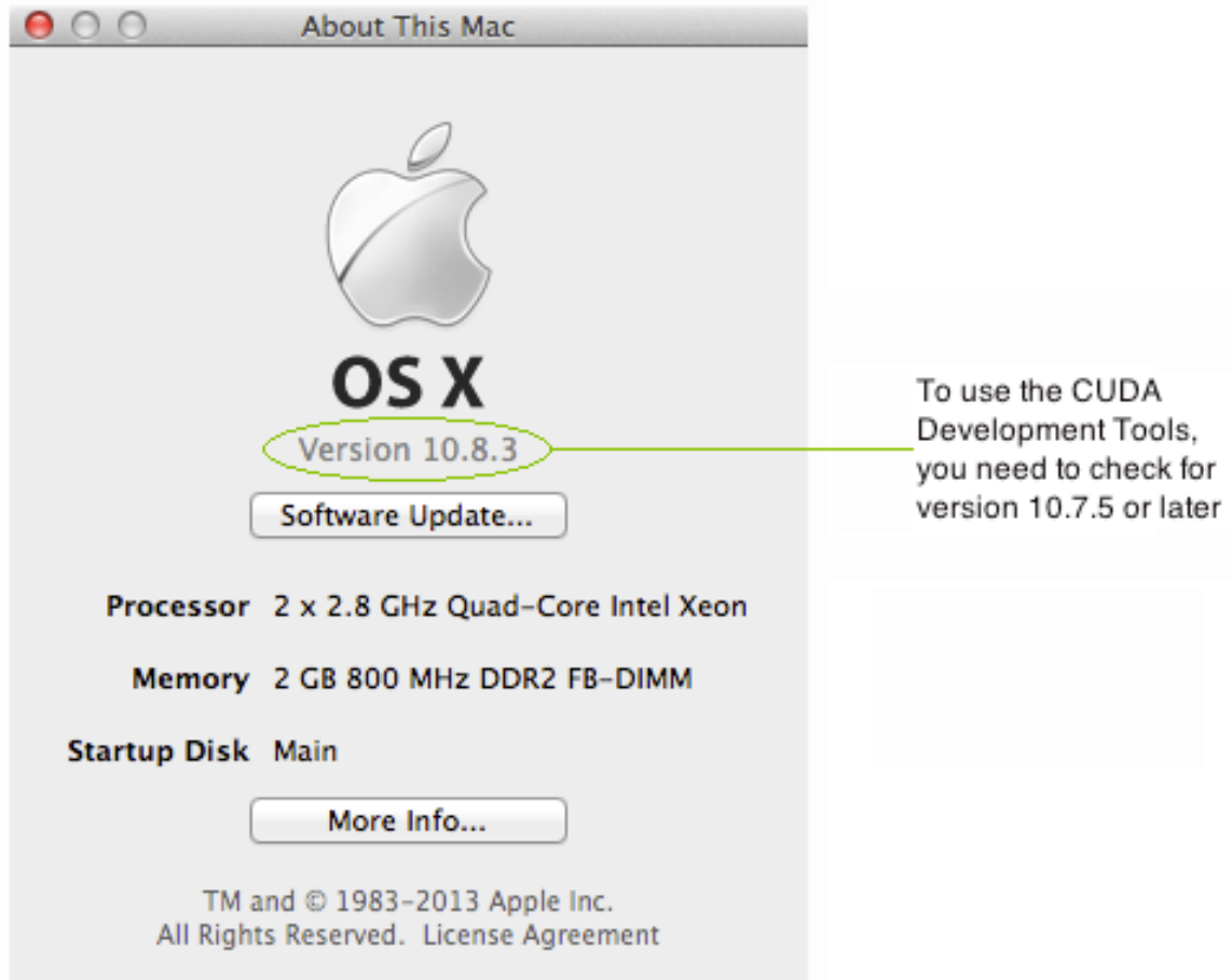
Figure 1 About This Mac Dialog Box